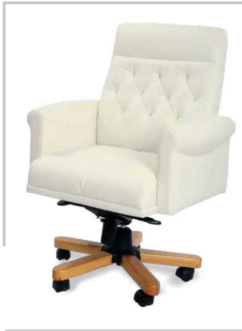
ALEC EXECUTIVE MEDIUM BACK CHAIR: Full upholstered ,knee tilting mechanism and wooden base with castors