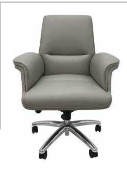
PROMAX EXECUTIVE MEDIUM BACK CHAIR: Fully Upholstered Seat back and Arms, Knee Tilting Mechanism, Aluminium Swivel Base with castors