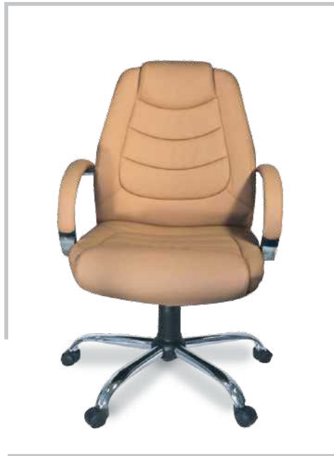
BRAD MEDIUM BACK CHAIR: Upholstered seat and back ,Aluminum padded arms, Tilting mechanism, chrome base with castors