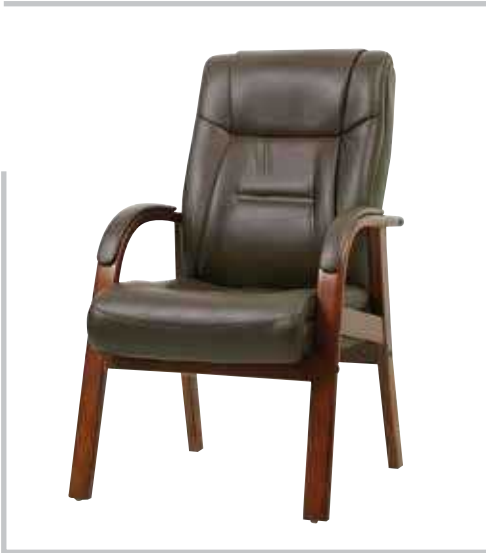
ADONA VISITOR CHAIR

Upholstered seat and back, wooden padded continuous arms, on four wooden legs