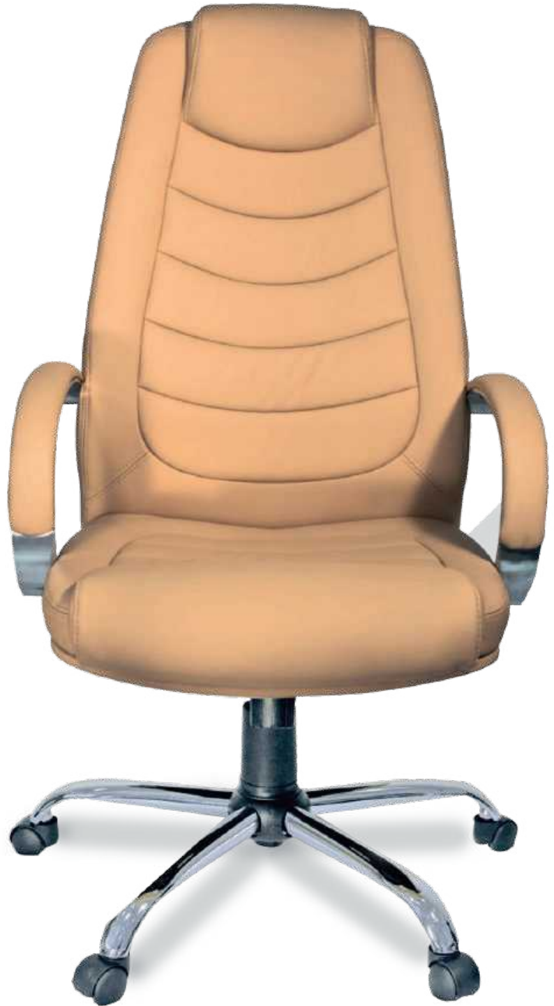
BRAD HIGH BACK CHAIR: Upholstered seat and back ,Aluminum padded arms ,Tilting mechanism chrome base with castors