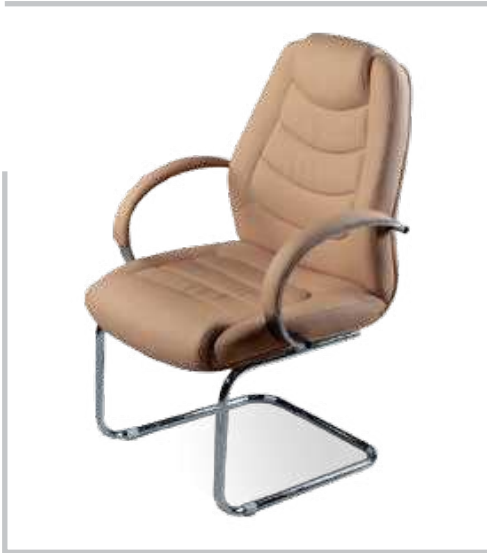
BRAD VISITOR CHAIR: Upholstered seat and back Aluminum padded arms chrome base & Chrome cantilever