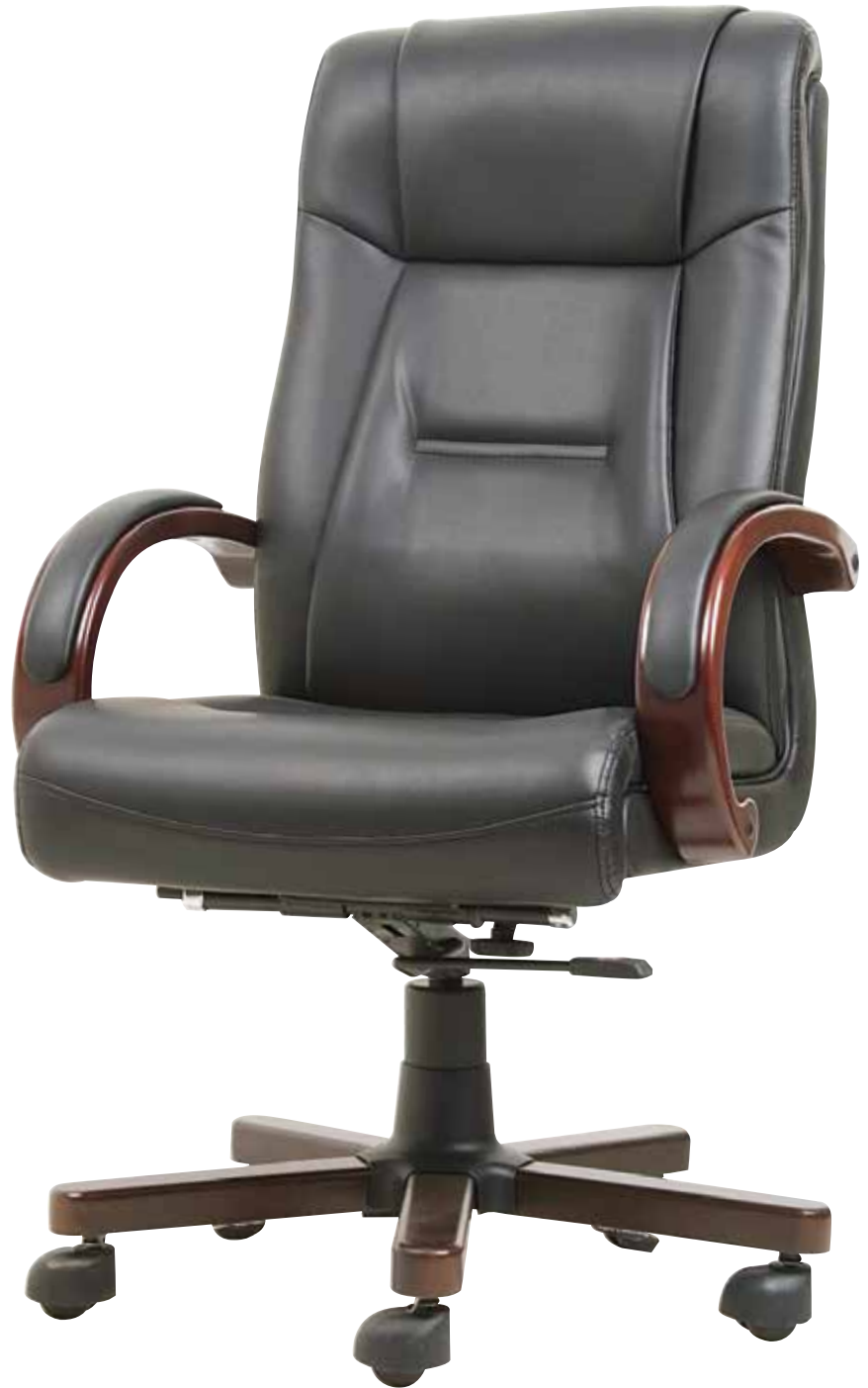
ADONA HIGH BACK CHAIR

HIGH BACK CHAIR SIDE VIEW Upholstered seat and back, wooden padded arms, tilting mechanism and wooden base with castors