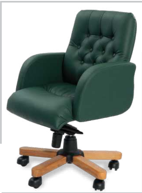
DAMAS EXECUTIVE MEDIUM BACK CHAIR: Fully upholstered arms knee tilting mechanism and wooden base with castors