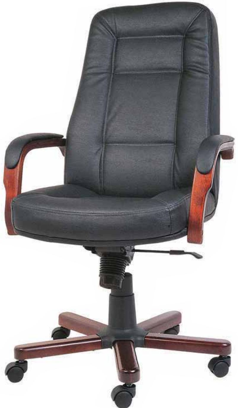
VERONICA HIGH BACK CHAIR: Upholstered seat and back, wooden padded arms, tilting mechanism and wooden base with castors