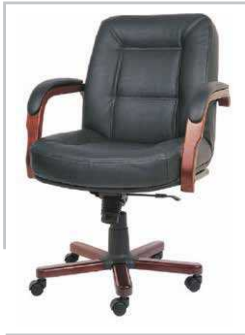
VERONICA MEDIUM BACK CHAIR: Upholstered seat and back, wooden padded arms, tilting mechanism and wooden base with castors