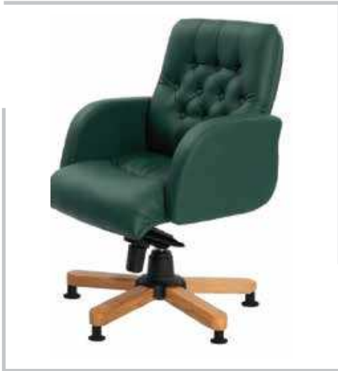
DAMAS EXECUTIVE VISITOR CHAIR: Fully upholstered & Wooden base with glides