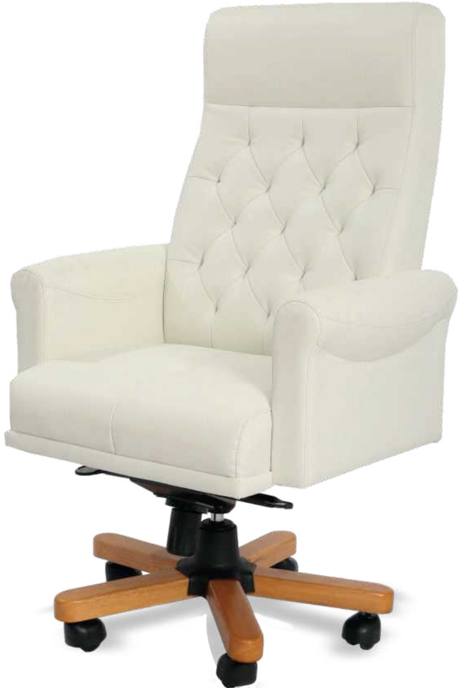
ALEC EXECUTIVE HIGH BACK CHAIR: Fully upholstered , knee tilting mechanism and wooden base with castors