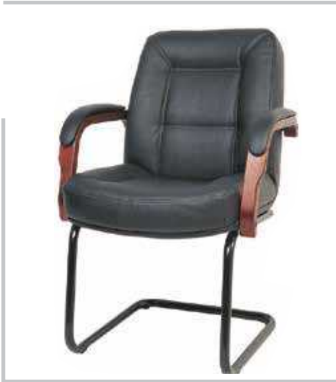
VERONICA VISITOR CHAIR: Upholstered seat and back, wooden padded arms, black cantilever base