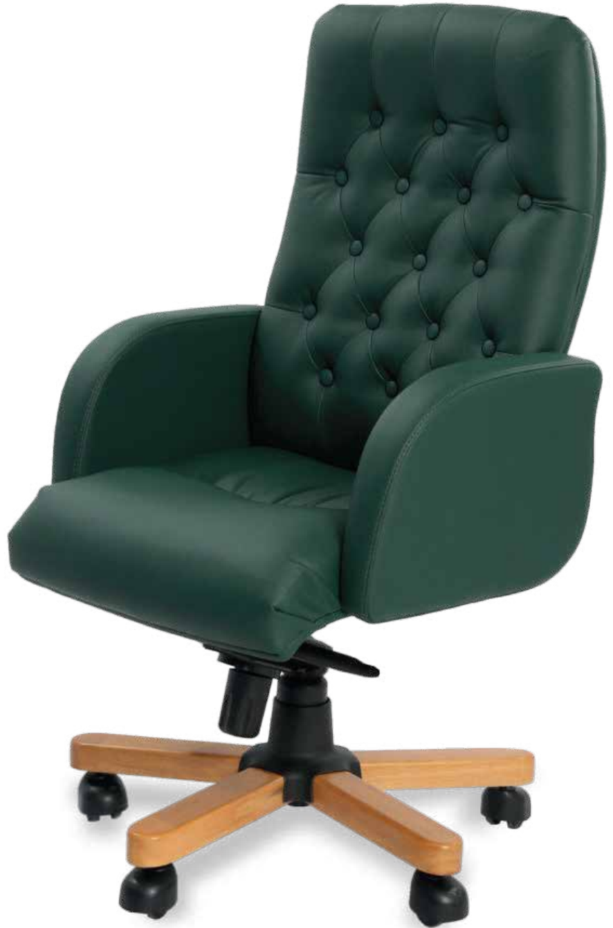
DAMAS EXECUTIVE HIGH BACK CHAIR: Fully upholstered arms knee tilting mechanism and wooden base with castors