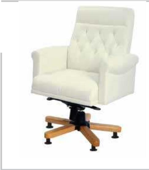
ALEC EXECUTIVE VISITOR CHAIR: Full upholstered & Wooden base with glides