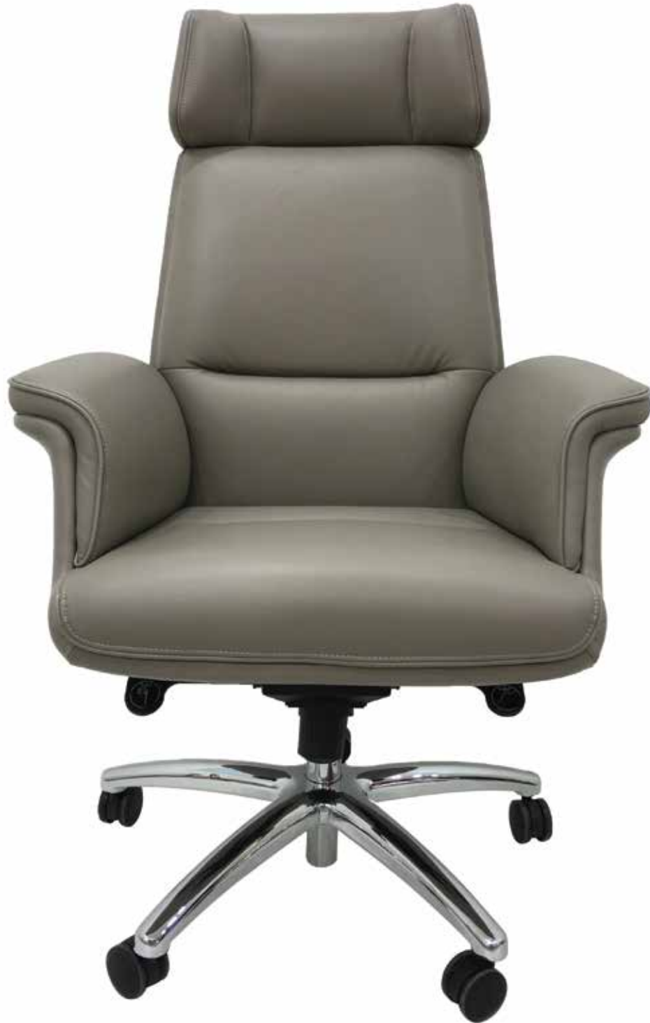
PROMAX EXECUTIVE HIGH BACK CHAIR: Swivel Chair: Fully Upholstered Seat back and Arms, Knee Tilting Mechanism, Aluminium Base with castors