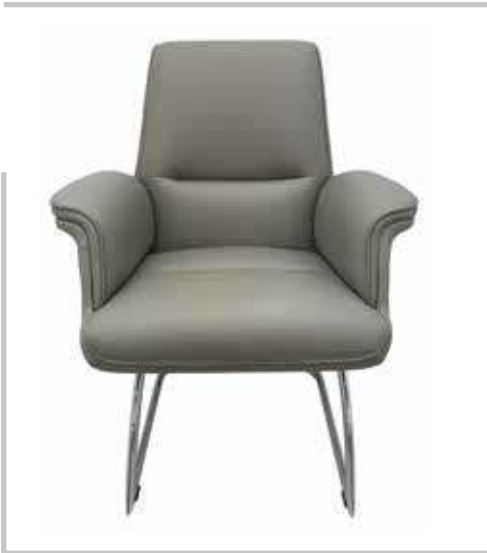
PROMAX EXECUTIVE VISITOR CHAIR: Fully Upholstered Seat back and arms, Chrome Cantilever Base.